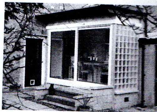
Top 22011 revamp entrance and add sun room Alford E30K